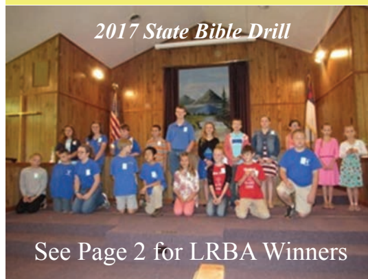
See Page 2 for LRBA Winners