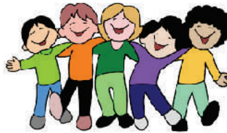
School age kids